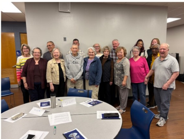
One of our small groups

The quilt that was made by many women of the church in 1982 has been cleaned and hung! Take a look at it in the stairwell heading down to the Kirk Center.