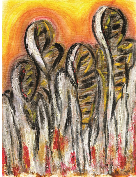
"Rubble" by Carmelle Beaugelin (Conte crayon, charcoal, acrylic, paprika paste, cinnamon)