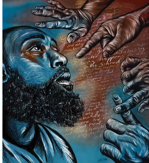
Insight by Lisle Gwynn Garrity Silk Painting with digital drawing and collage