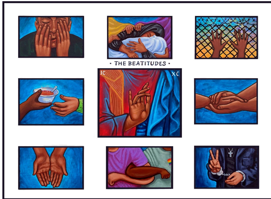
The Beatitudes by Kelly Latimore