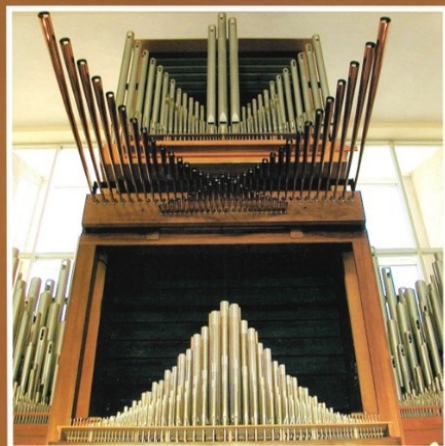
Mount Vernon Presbyterian Church Atlanta, Georgia

Mount Vernon organists who have played the Austin organ are: