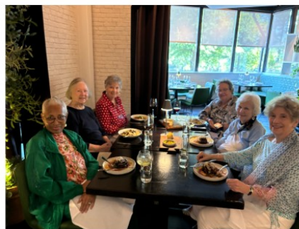
Healthy Aging Planning Dinner