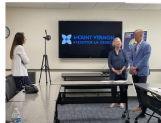
Healthy Aging Interview