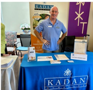
Some of the vendors