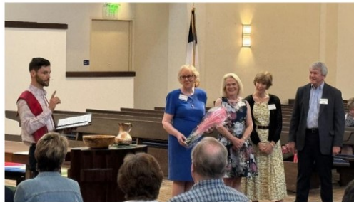
New Stephen Ministers