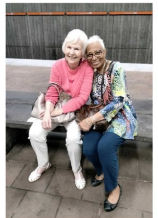
Senior Adults at the High Museum