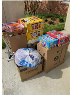
Stirred Up Ministries "Stuff the Bus"