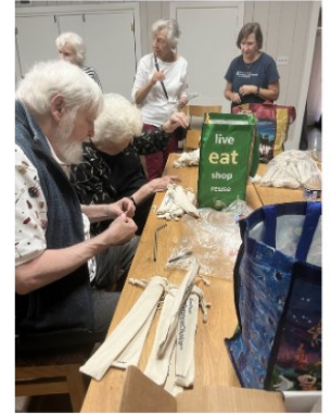
SSEF Book Sorting