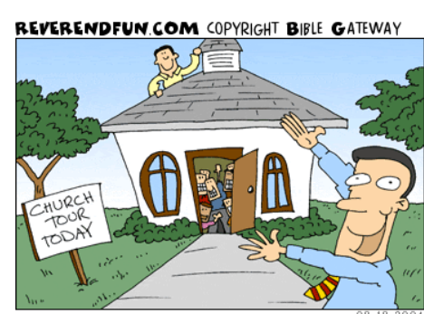
HERE IS THE CHURCH, HERE IS THE STEEPLE ... OPEN THE DOOR, AND THERE ARE THE PEOPLE