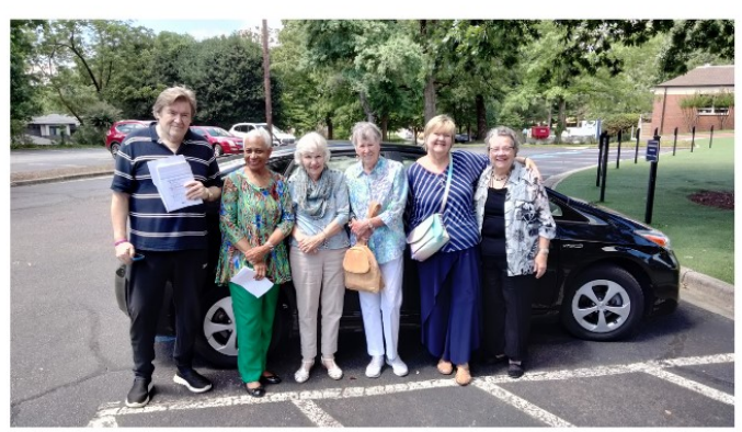
Senior Adult Trip to High Museum July 9