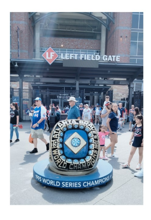
Atlanta Braves Game June 11