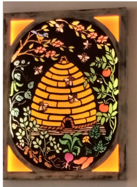
Lunch at Tupelo Honey Restaurant April 30