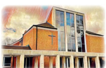
Mount Vernon Presbyterian Church Directory 2021-2022