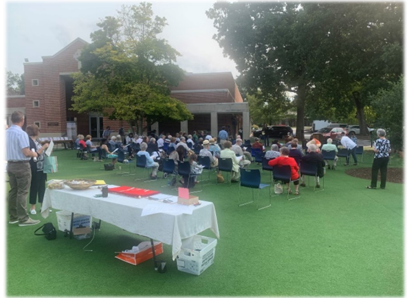
Beautiful day in the neighborhood...