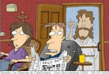
HOW LONG DO YOU SUPPOSE HE WILL KEEP KNOCKING?

www.mvpchurch.org facebook.com/mountvernonpresbyterianchurch/ Instagram: mvp church