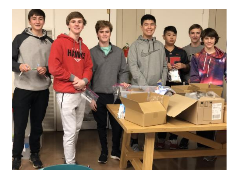
"As disciples of Jesus Christ, we listen to scripture, tradition, one another, and the world in order to understand God's will for us as individuals and as a community"

The youth group plans to go downtown sometime in February to feed the homeless and hand out the hygiene kits they assembled. Please pray as we continue to search for the new Youth Director.