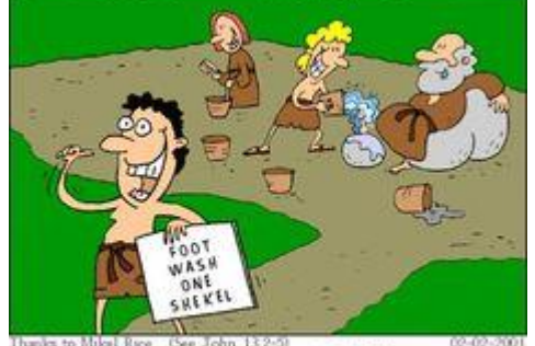
YOUTH GROUP FUNDRAISERS IN THE EARLY CHURCH